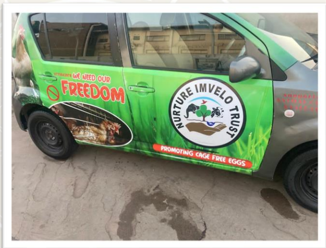
Sanele and her team make farm visits and express their appreciation to cage-free farmers by advertising their eggs on the Nuture Imvelo Trust’s online platform.